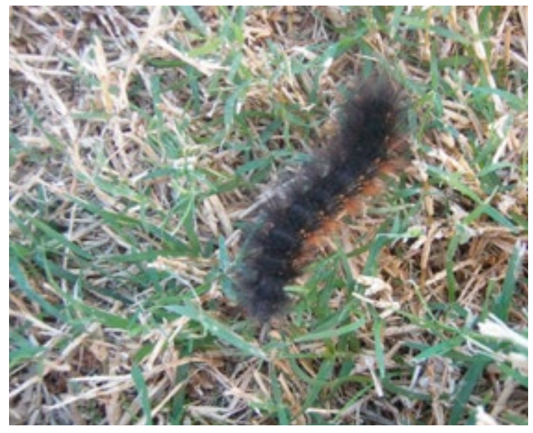
Garden/ great tiger moth caterpillar

While these caterpillars can be highly variable for individual species, the common ones seen lately are woollybear (Isabella tiger moth), saltmarsh caterpillar (saltmarsh moth), and garden tiger moth caterpillar, also known as the great tiger moth caterpillar. Woollybear caterpillars are usually black on each end with brown in the middle. Saltmarsh caterpillars are variable and can be a creamy yellow to brown to black in color. Garden/ great tiger moth caterpillars tend to be black on the top part of the body and brown on the bottom.